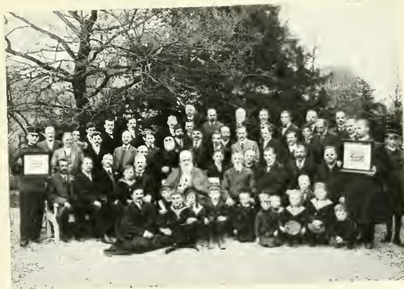
ABDUL BAHÁ WITH SOME OTHER BAHÁIS IN STUTTGART